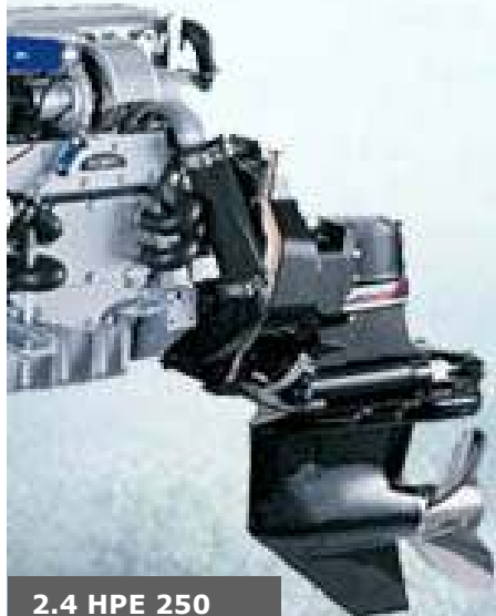
2.4 HPE 250