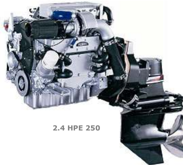
2.4 HPE 250